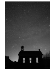
B & W